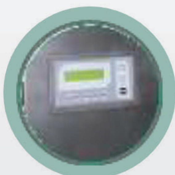
Front LCD Display